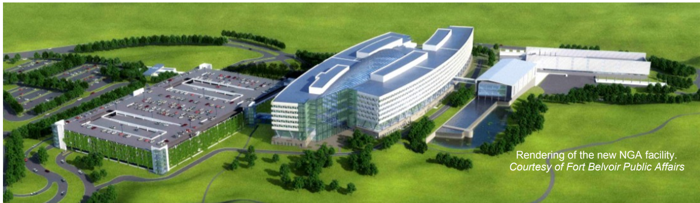
Rendering of the new NGA facility.

The NGA is a Department of Defense agency that develops imagery and map-based intelligence solutions for national defense, homeland security, and safety of navigation. Groundbreaking for the new facility took place in September 2007. NGA plans to begin moving its workforce during 2010.